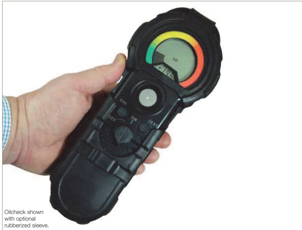
Oilcheck shown with optional rubberized sleeve.

Parker's Oilcheck is completely portable and battery powered with a numerical display that indicates positive or negative increase in dielectrics. Oilcheck gives an early warning of impending engine failure and the simplistic hand-held design makes it easy to use.