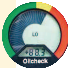
Green/amber/red numerical value